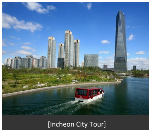
[Incheon City Tour]