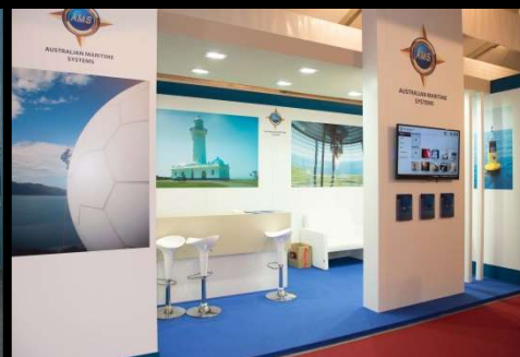
[IMC Exhibition, Spain]