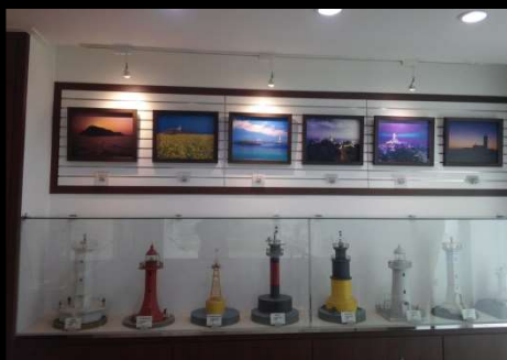
[National Lighthouse Museum]