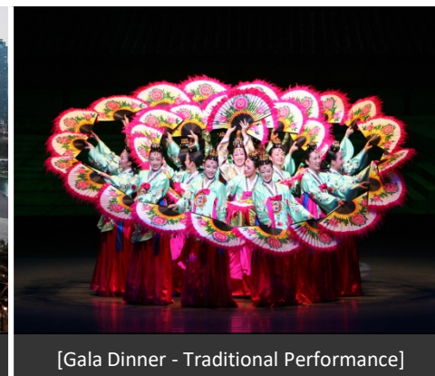
[Gala Dinner - Traditional Performance]