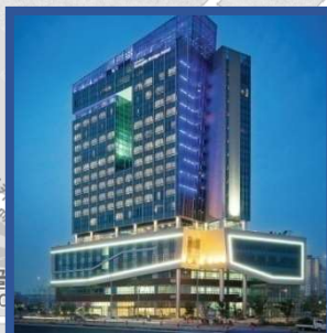
BENIKEA Songdo Bridge