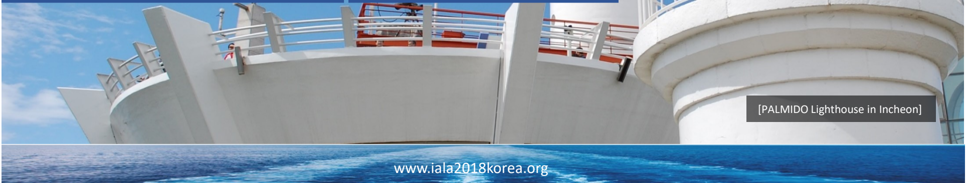
[PALMIDO Lighthouse in Incheon]