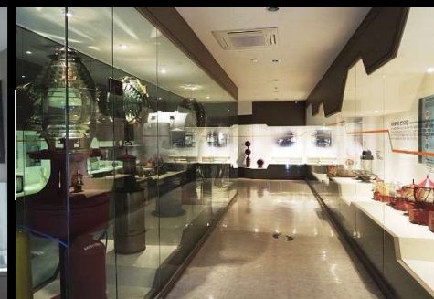
[National Lighthouse Museum]