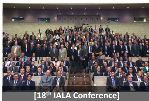
[18 th IALA Conference]