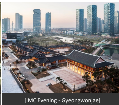
[IMC Evening - Gyeongwonjae]