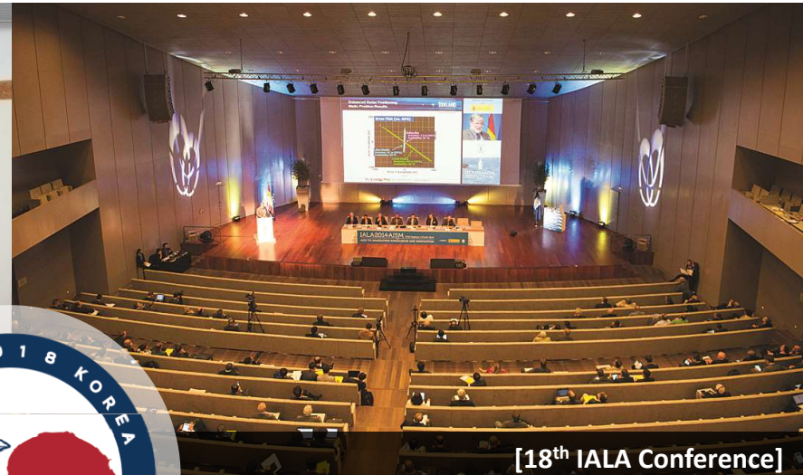
[18 th IALA Conference]