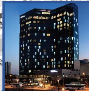
ORAKAI Songdo Park