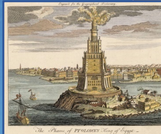
The Lighthouse at Alexandria