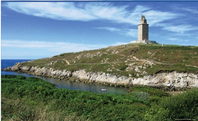
UNESCO's World Heritage - The Tower of Hercules

"Incheon Declaration on historic lighthouse as world heritage"