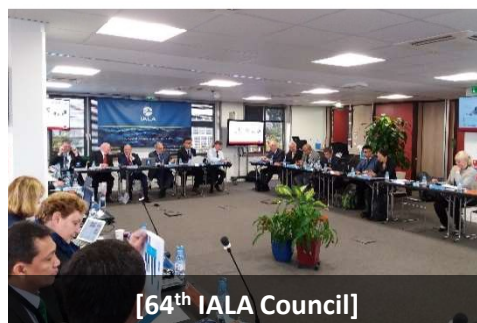
[64 th IALA Council]