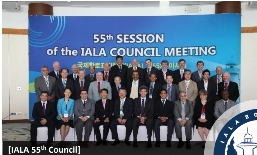
[IALA 55 th Council]

19 th IALA Conference 2018 Incheon, Republic of Korea