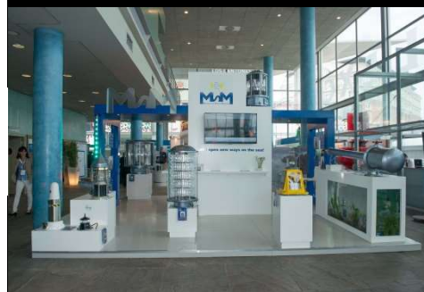
[IMC Exhibition, Spain]