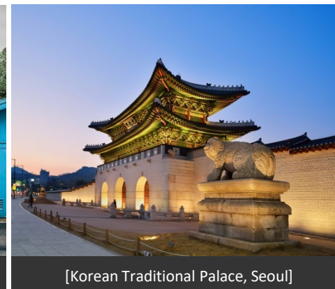
[Korean Traditional Palace, Seoul]